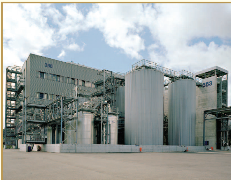
Production of Vitamin B at TRM's collaborative raw material synthesiser.

Fresh green food contains a lot of Folic Acid but unfortunately many horses and ponies do not have access to grass all the time and during the winter intakes are minimal. For example, it has been reported by several researchers that serum folate concentrations in horses on pasture were much higher (about three to four times) than that of stabled horses fed conserved forage. Typically alfalfa will supply 2.5-4mg/kg DM. of Folate, Timothy hay around 2.3mg, and cereal grains just 0.3-0.6mg. In view of the fact that B12 and Folic Acid are essential for red blood cell production in the bone marrow, dietary supplementation is obligatory, particularly for horses in work.